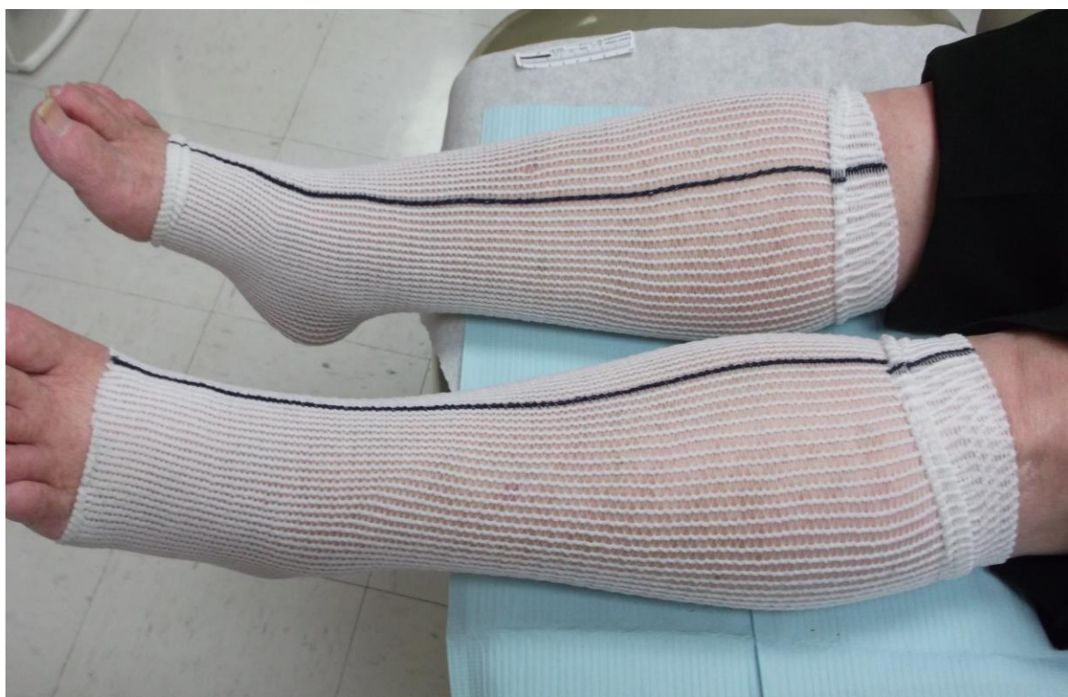
Figure 1: Patient wearing tubular elastic bandage system

Twenty-one patients seen in a community-based wound clinic, who had failed traditional compression therapies, were dispensed a single layer longitudinal tubular latex free elastic bandage system.