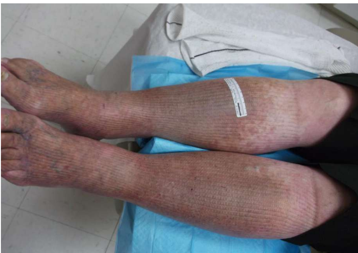
Figure 2: Presence of wales post-wear

*EdemaWear® Compression Dynamics Omaha, NB