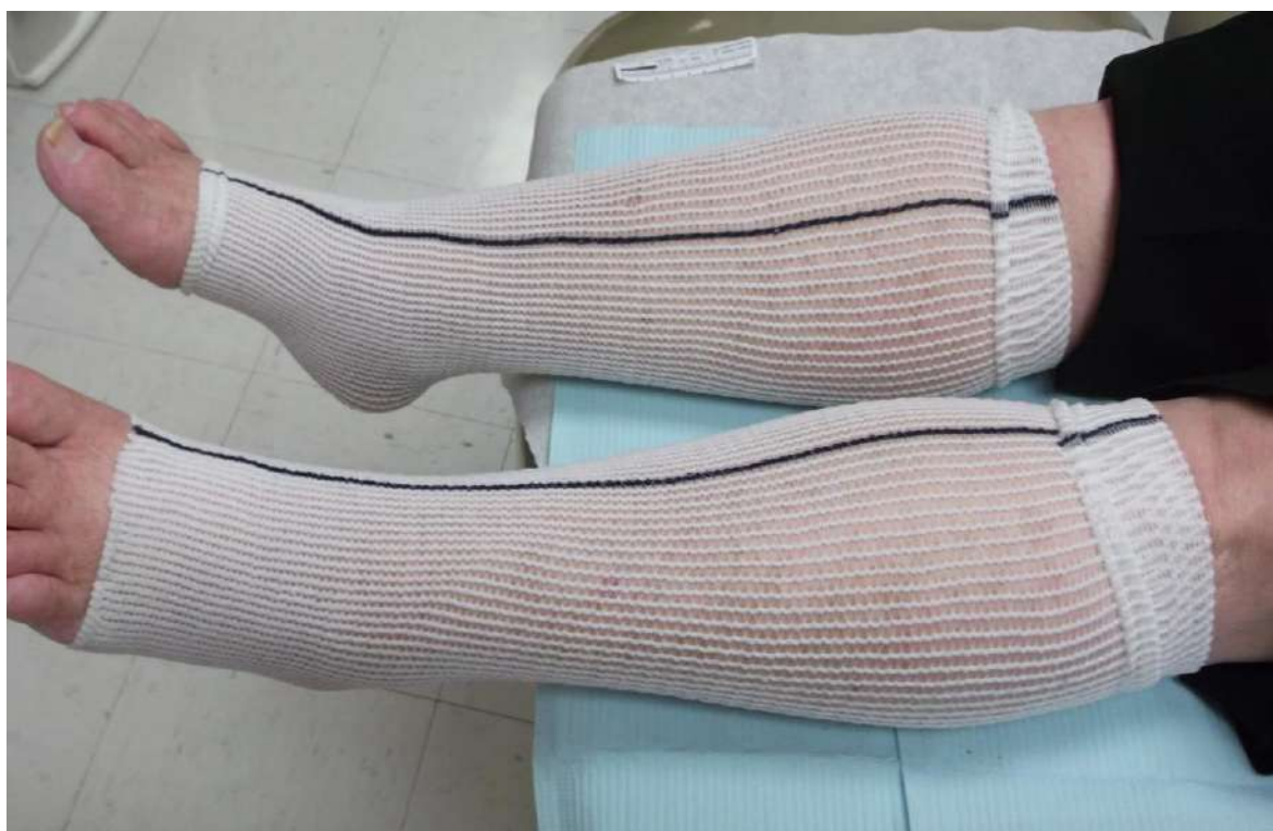
Figure 1: Patient wearing tubular elastic bandage system

Twenty-one patients seen in a community-based wound clinic, who had failed traditional compression therapies, were dispensed a single layer longitudinal tubular latex free elastic bandage system.